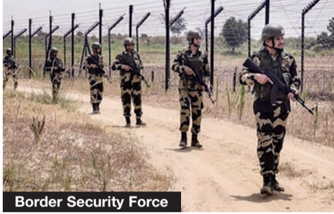
Border Security Force

A major milestone has been the deployment and management of over three lakh surveillance cameras for election monitoring across multiple states, ensuring transparency and security during large-scale democratic exercises. Brihaspathi Technologies has also strengthened border security through advanced surveillance solutions